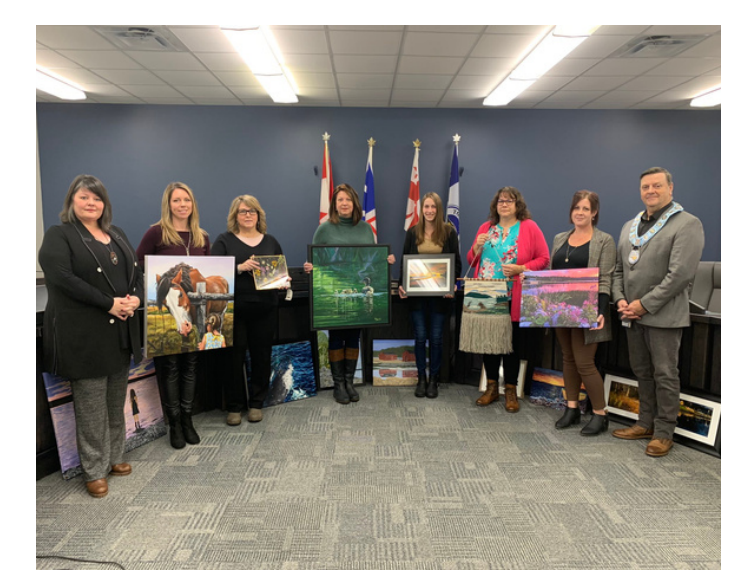
These artworks will be displayed in the lobby of the Town Hall during 2023.